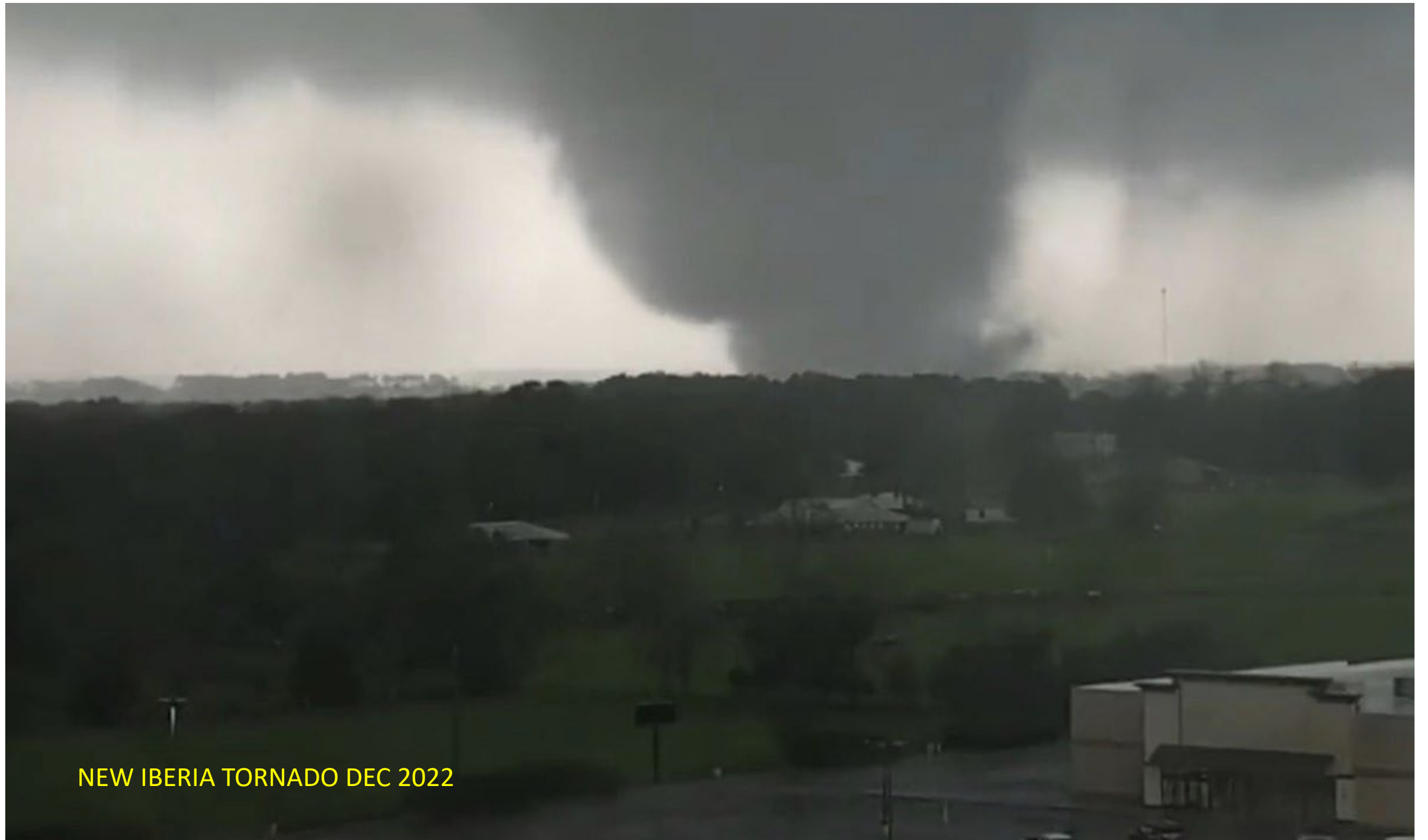
NEW IBERIA TORNADO DEC 2022