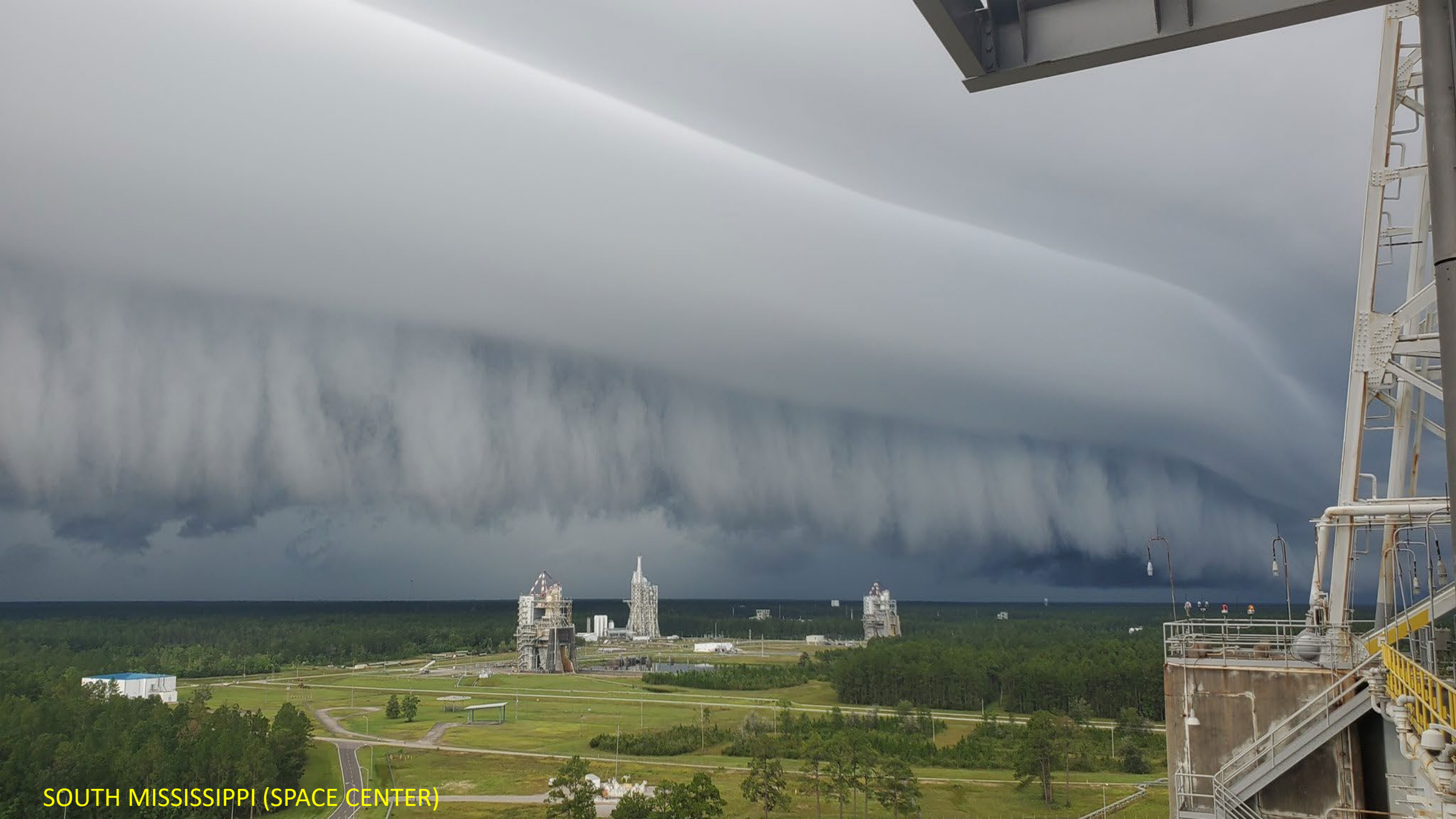
SOUTH MISSISSIPPI (SPACE CENTER)