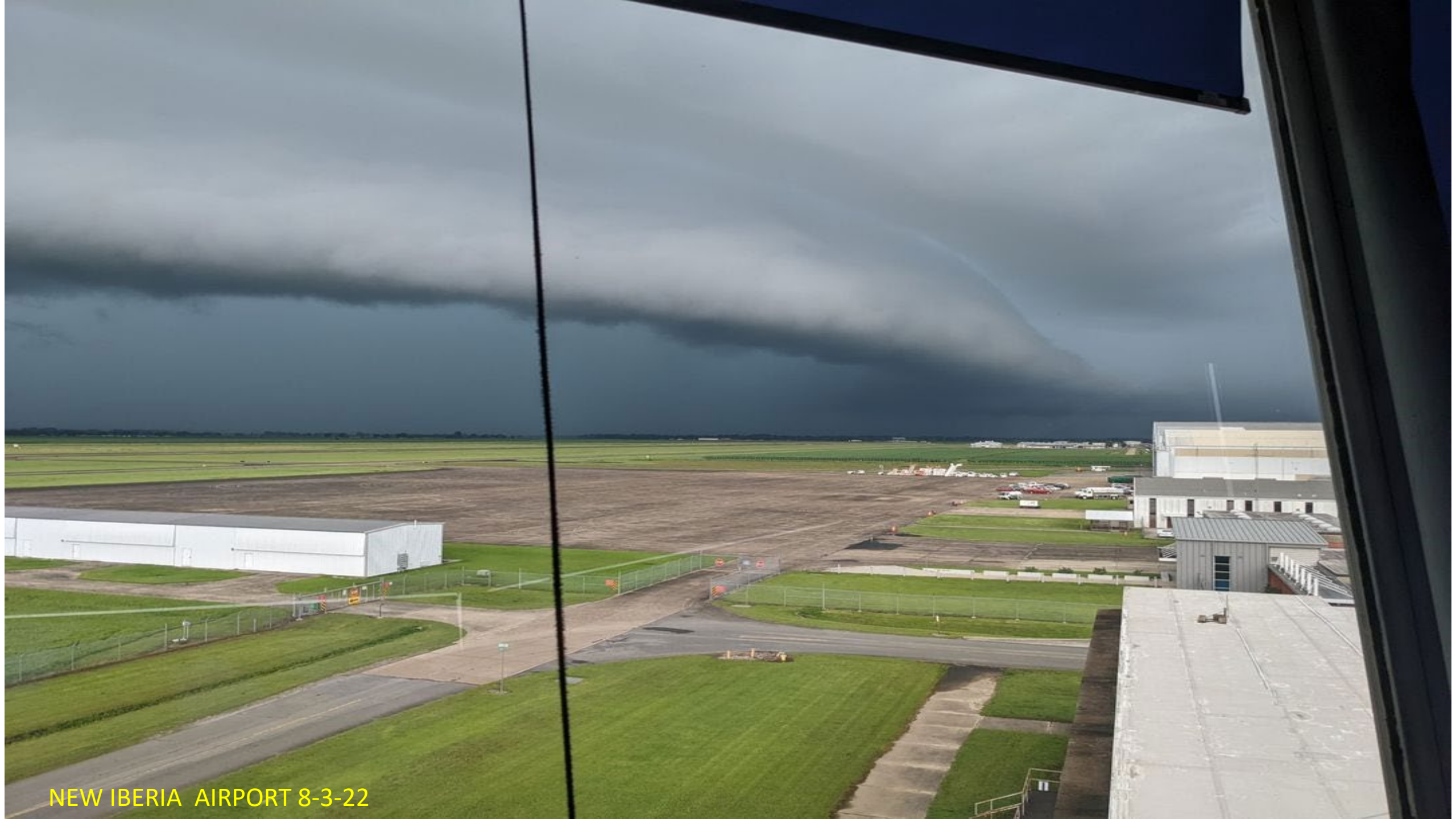
NEW IBERIA AIRPORT 8-3-22