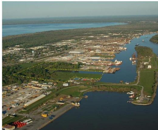
Aerial view of property fronting on Woodland and Youngswood Roads (Property borders are indicated by yellow outline in center left of photo)